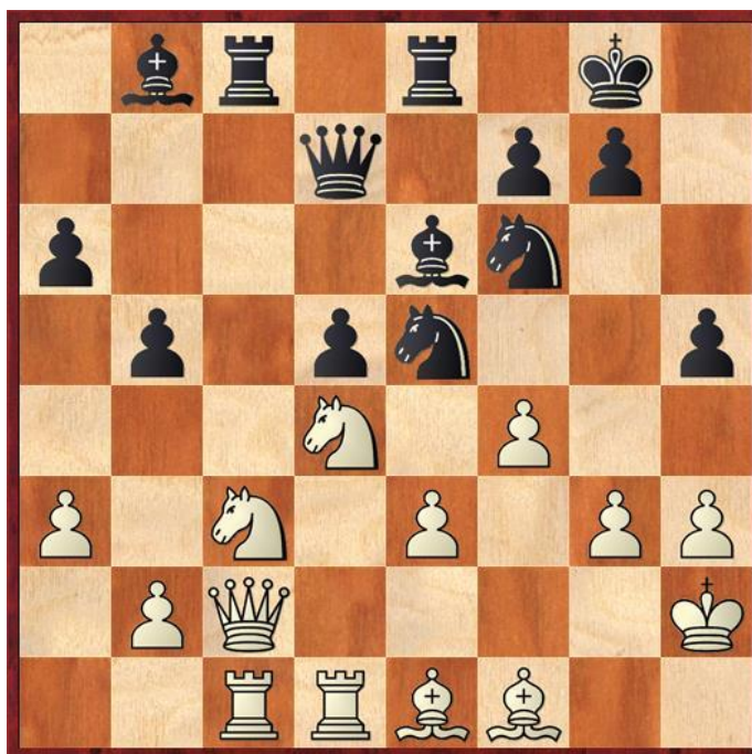
Position after 23.f4