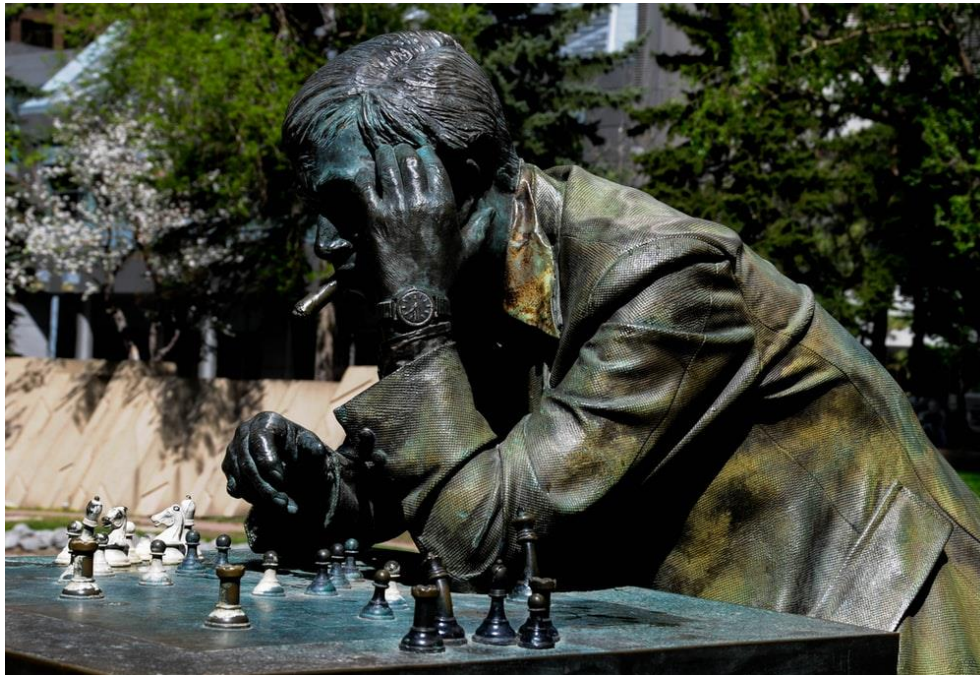
The Reeeeeaaaallllly Long Think...

This issue is dedicated to you, the player! We have organized a USA Friendly Match on an average of 1 per month (100+ Friendly Matches) over the past 9 years, and you made it possible! A sincere thanks goes out to all of you who have participated in the Friendly Matches!